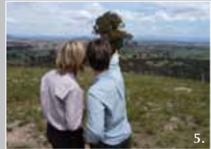
Images: 1. Yankee Hat Rock Art in Namadgi National Park. Photo: Linda Roberts. 2. Elm Grove homestead. Photo: Linda Roberts. 3. Plans for Canberra's International Arboretum. Image: TCL. 4. London Bridge geological site. Photo: Peter Dowling. 5. View of Canberra from Oak Hill. Photo: Linda Roberts.