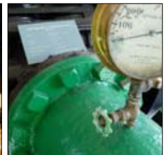
Namadgi Walk, Cotter Dam Wall, Stromlo Observatory, Cotter Pump House. Namadgi photo provided by ACT Territory and Municipal services; other photos provided by National Trust (ACT). Stromlo Observatory painting by Kim Nelson, commissioned by National Trust (ACT).