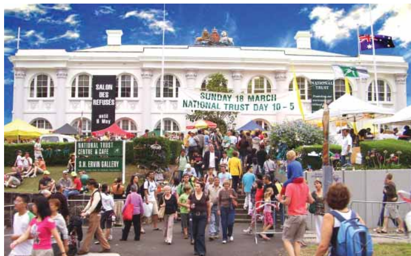
National Trust Day brought around 40,000 people to the Trust Centre

The first ever National Trust Day was held on 18 March, with around 40,000 people attending at the National Trust Centre on Observatory Hill. Food markets, bands, stalls from each department and exhibitions kept