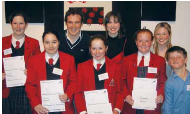
Hundreds of students attended the annual presentation of Awards in the Schools Competition, a National Trust Heritage Festival event sponsored by the Commonwealth Bank