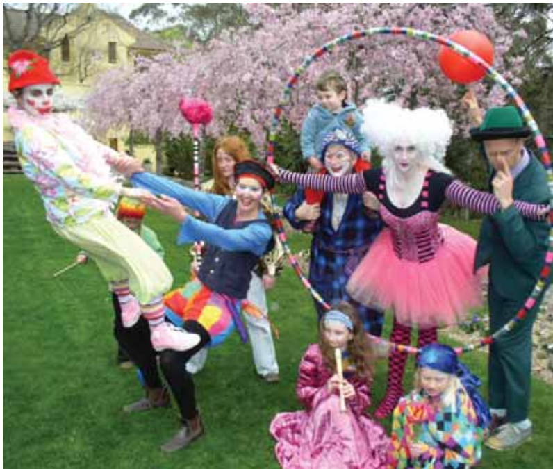
Creative cavortings at Cirquinox, Everglades