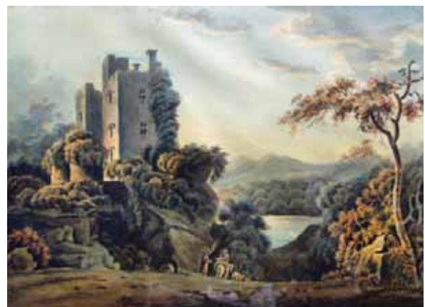
The Castle, Ballyhooley

As a child I played in the tower, climbing up the spiral wooden staircase, pausing at each level to visit its large single room, kitchen, the dining