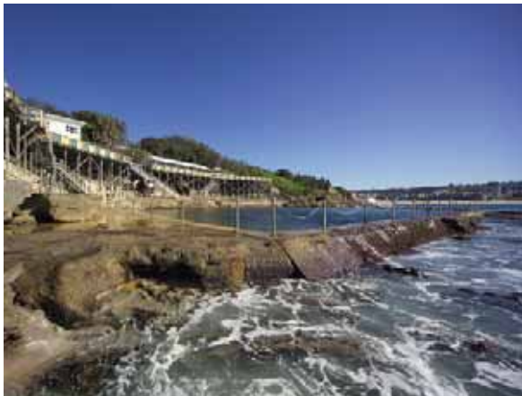
Wylie's Baths.