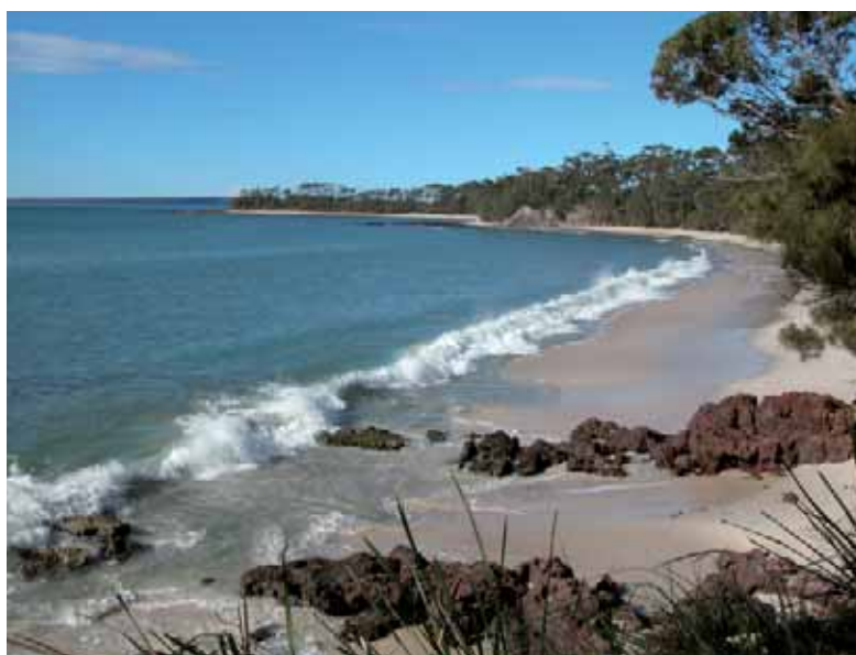
Jervis Bay.

Then, of course, there is my father's poem, The Bishop , about one of the two bronze statues at the top of the wide steps leading up to the