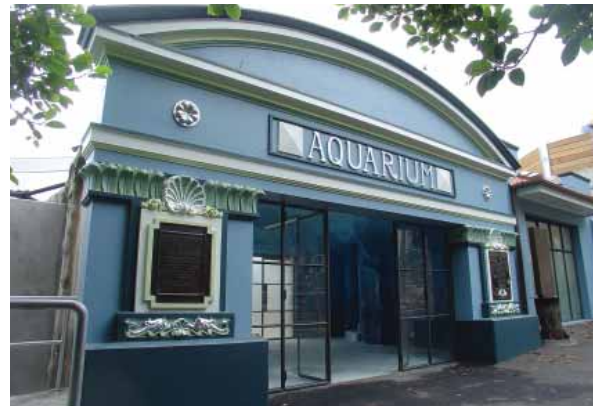
The refurbished Aquarium

The picture of this environment has been with me ever since and has influenced my work. My first house was built in a similar landscape without the water and at one time I built a house for myself at Cottage Point overlooking Cowan Creek. I have been fortunate enough to design houses ever since on land with similar attributes but never on land so sublime.