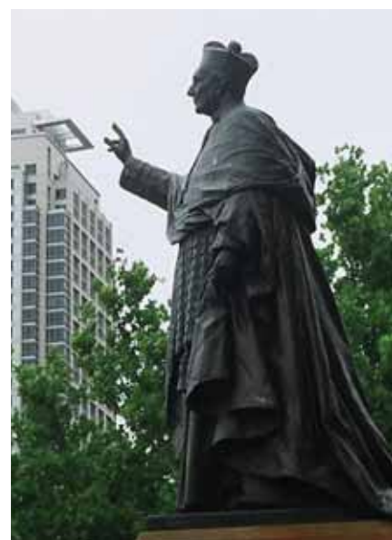
The Bishop, with outstretched arm, at the entrance to St Mary's Cathedral.