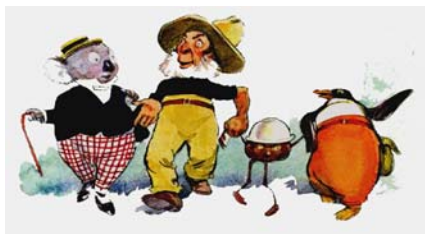
The Magic Pudding by Norman Lindsay

www.nsw.nationaltrust.org.au or www.dymocks.com.au