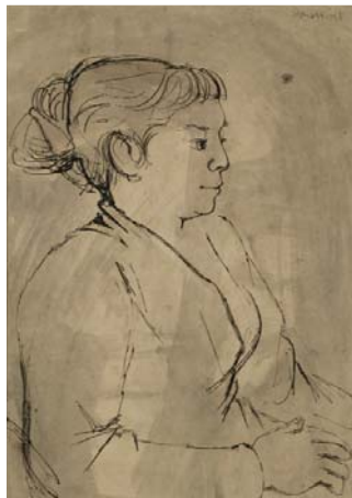
DONALD FRIEND Margaret Olley 1948