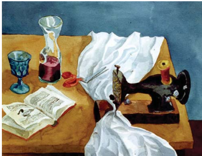
DONALD FRIEND The Sewing Machine 1985

Friendships between artists have long been the source of curiosity, mythology and imaginings of wildly creative and bohemian lifestyles. This exhibition celebrates the 40 year friendship between well-known artists Margaret Olley (b.1923) and Donald Friend (1915-1989). Although their artistic practice differed – Friend was fascinated with the figure and satire in contrast to Olley who has pursued a lifelong commitment to still life - both possessed a great spirit of adventure and desire to create art. This exhibition, comprises over 50 important paintings and drawings from collections across the country and also reveals some hidden gems.