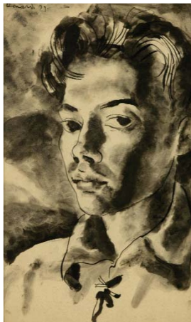
DONALD FRIEND Self portrait 1939 Collection: S.H. Ervin Gallery

Reproduced with the permission of the estate of the late Donald Friend