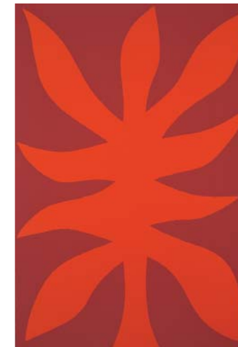
JOHN COBURN Flame tree 1976 Gift of the artist 1979 Collection: Art Gallery of New South Wales © John Coburn

With the proliferation of artists producing prints in Australia, it is timely to look at the contribution of the Sydney Printmakers group. Established in 1961 as an artist-run project, Sydney Printmakers promote printmaking as a vital form of cultural expression.