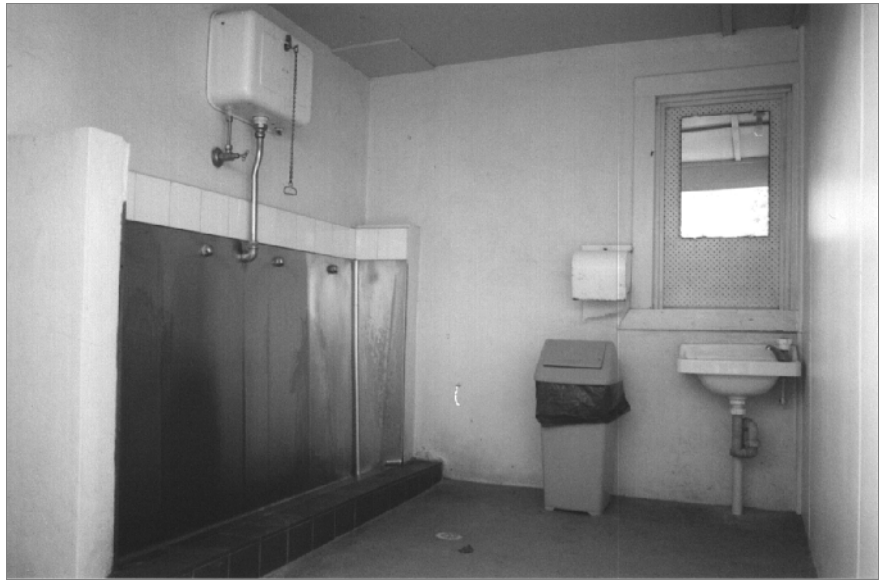
Male toilet. PF photograph 1998